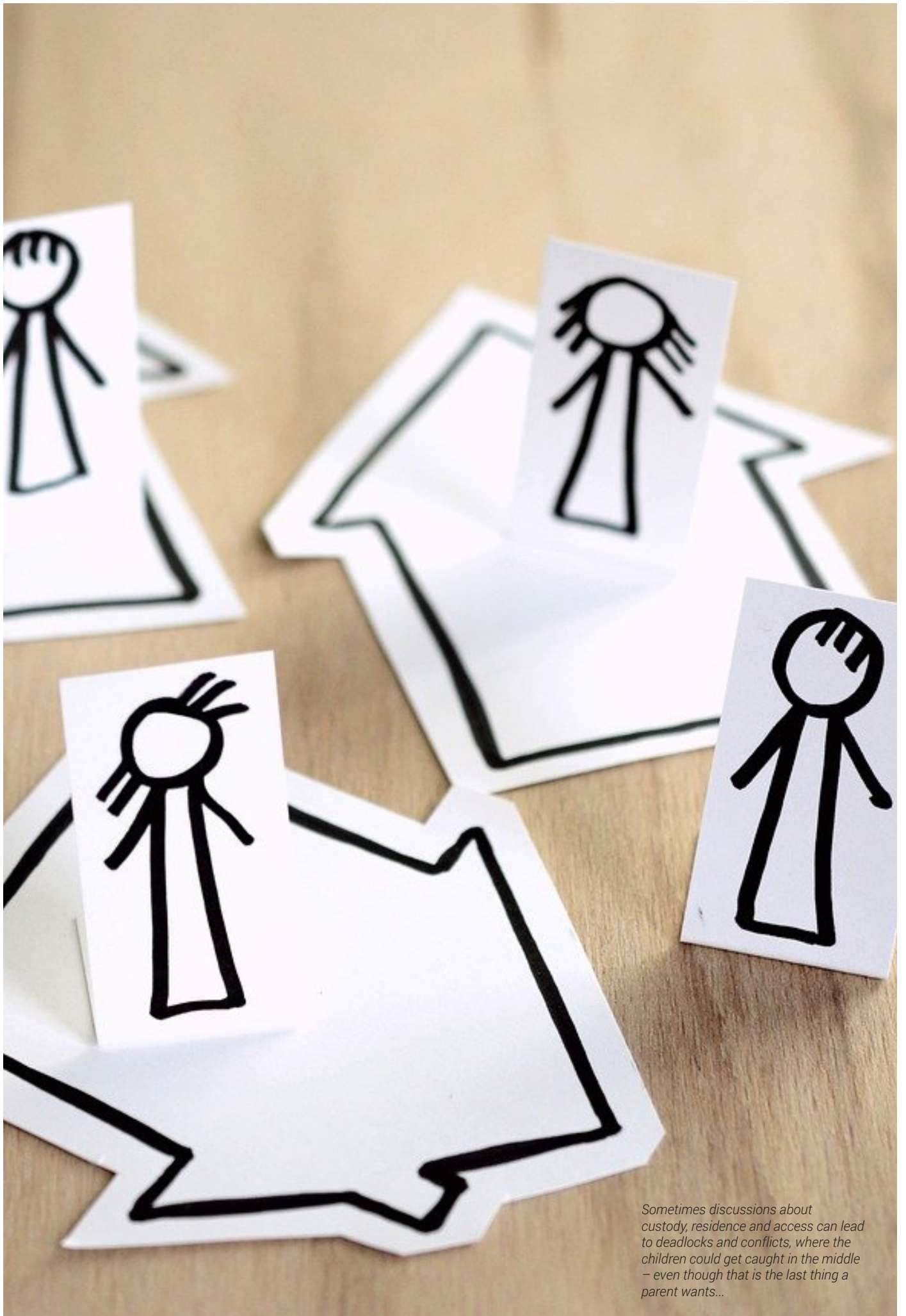
Sometimes discussions about custody, residence and access can lead to deadlocks and conflicts, where the children could get caught in the middle – even though that is the last thing a parent wants...